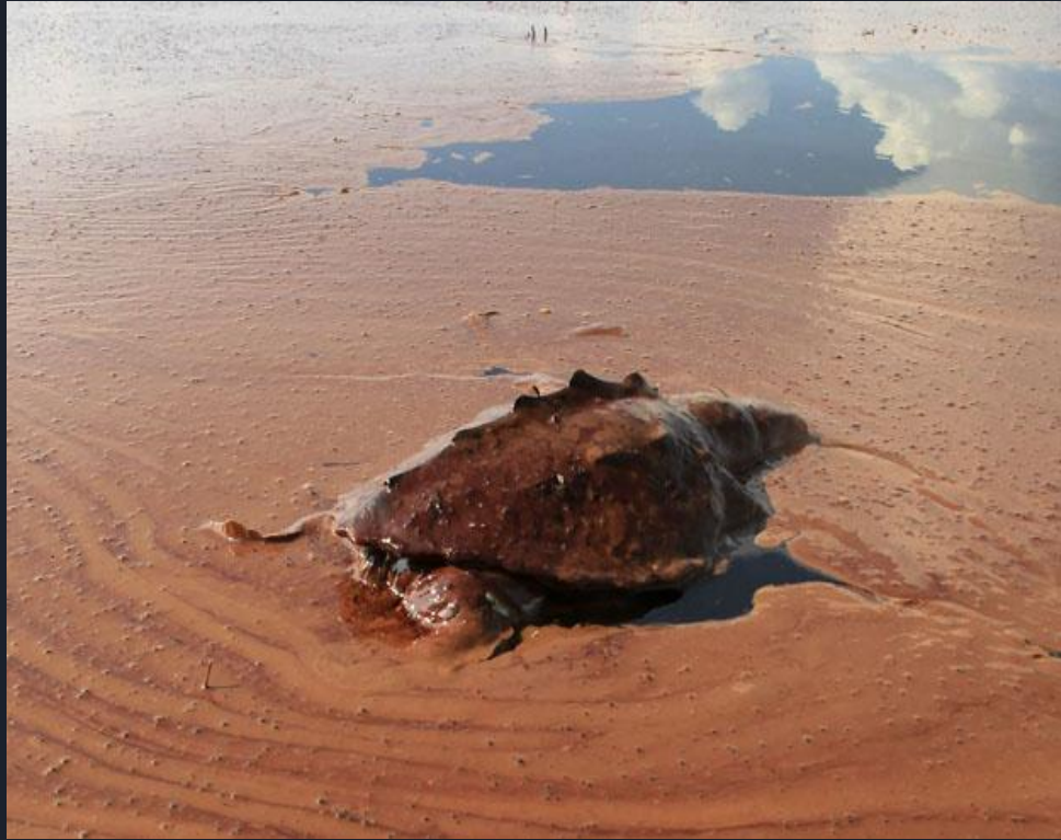
A dead turtle floats on a pool of oil from the Deepwater Horizon oil spill in Barataria Bay off the coast of Louisiana, Monday, June, 7, 2010.